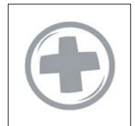
Features and Benefits